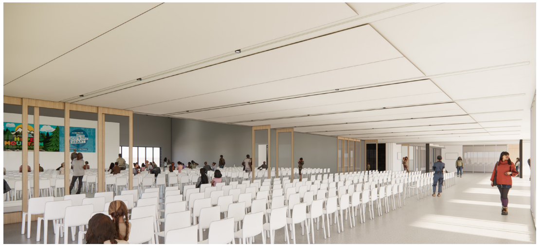
INTERIOR OVERFLOW GATHERING