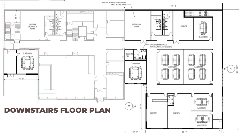
DOWNSTAIRS FLOOR PLAN