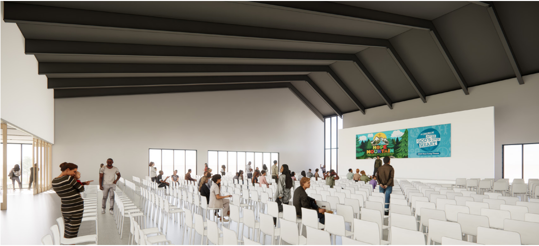
INTERIOR WORSHIP CENTER